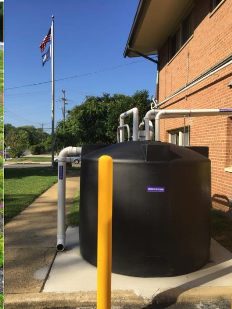
Fire Stn #206