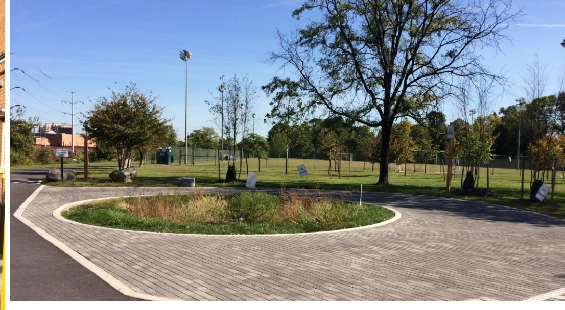
Permeable Pavers and Bioretention Cell, 4MR Park