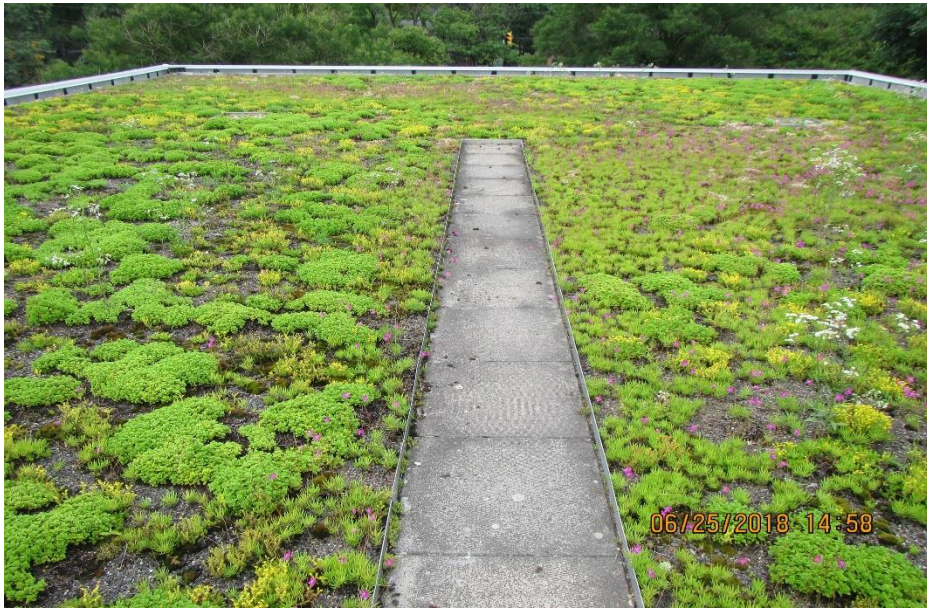
Charles Houston Rec Center