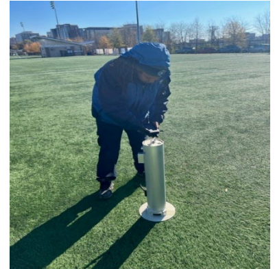
G-Max field testing at Witter.