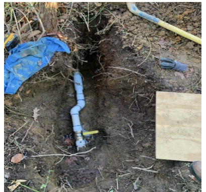
Valve replacement at Chinquapin.