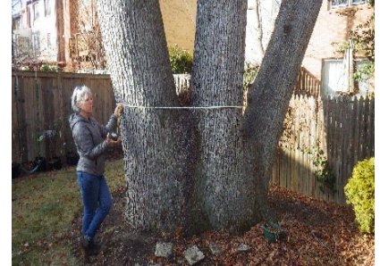
State Co-Champion Liquidambar Styraciflua.