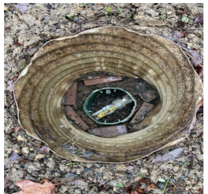
Valve replacement at Chinquapin.