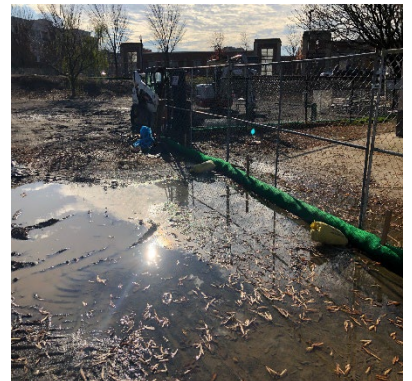
Simpson dog park renovation.