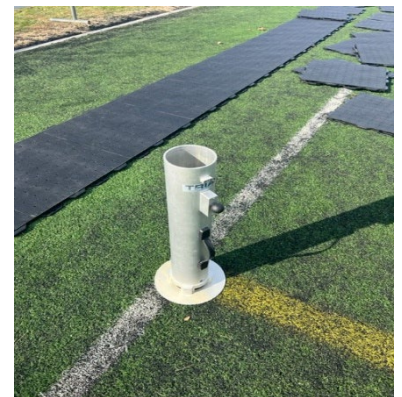
G-Max field testing at Brenman.