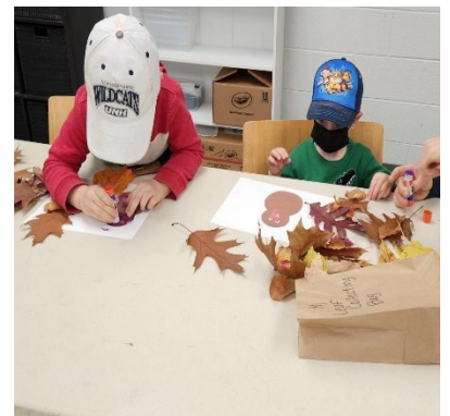
Our little adventures group making turkeys with leaves.