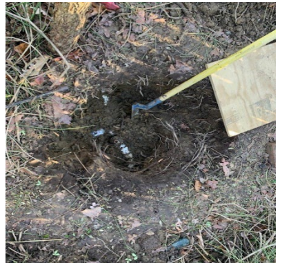
Valve replacement at Chinquapin.