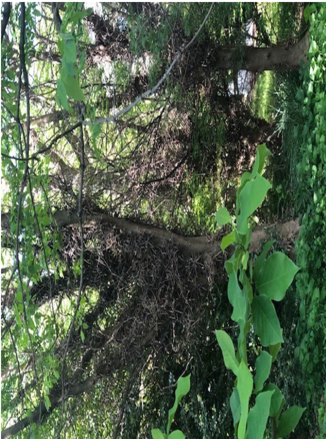
Close up of several honey locusts at that location