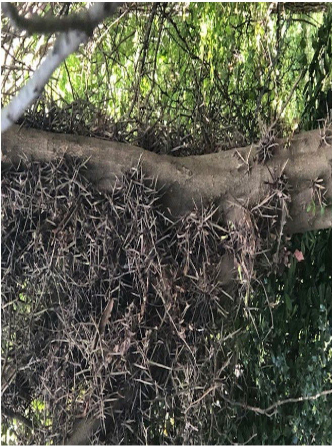
close up of thorns