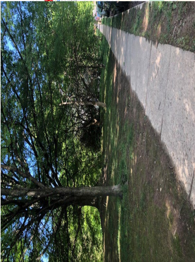
Standing at corner of playground facing direction of honey locusts trees with thorns