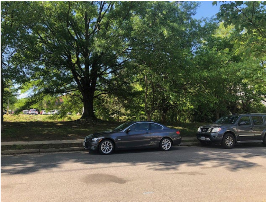
Here you can see the YMCA in the distance. The honey locusts are on the right behind the SUV.