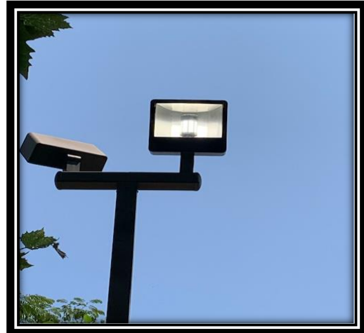
These photos are at Ewald Playground. We converted the old existing metal halide lights to LED