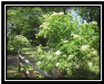
Elderberry in bloom at Tarleton Park