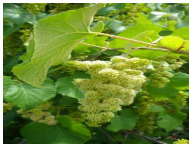
Possum Grape in bloom at Four Mile Run Park