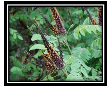
Tall Indigo-bush in tidal shores and shrub swamps along the Potomac River