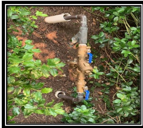
This photo is a backflow preventer we replaced at the Linear Trail at Cameron Station.