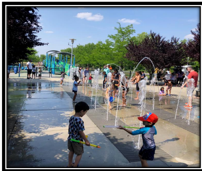
Interactive Fountain at Potomac Yard